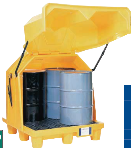
Gull Wing 4-Drum Outdoor Model 1081