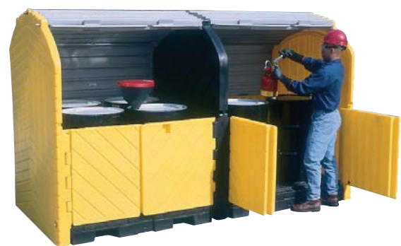
Hard Top 8-Drum Plus Outdoor Model 9651