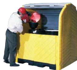
Hard Top 4-Drum Plus Outdoor Model 9637