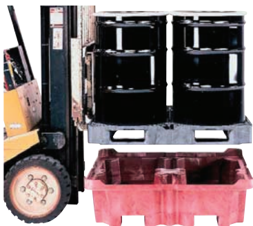
SpillKingPallet Model 0802