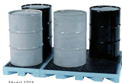
Spill Deck Fluorinated