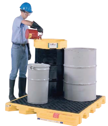
SpillDeck P4 Bladder System 4-Drum Model 2330