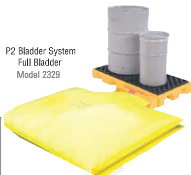
P2 Bladder System Full Bladder Model 2329