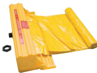
SpillDeck Bladder Attachment