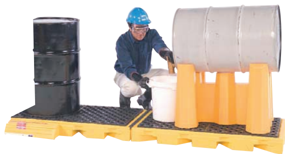
InLine SpillDeck Bladder System 4-Drum Model 2361