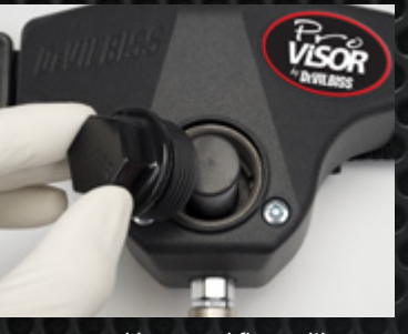
pressure and increased flow, with an audible warning if pressure falls too low.

Complete visor kit with waist belt Waist belt and regulator PROV-36-K10 Pack of 10 visor tear-offs PROV-36-K50 Pack of 50 visor tear-offs PROV-27-K4 Pack of 4 filter elements Breathing air tube PROV-52-K2 Pack of two lint free brow bands Washable, anti-static hood