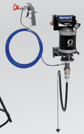
30:1 airless wall mount