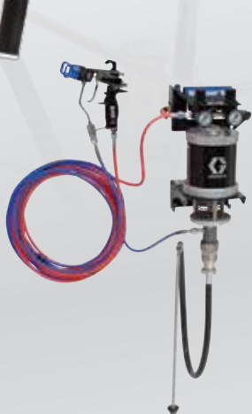
30:1 air-assist wall mount