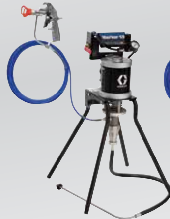
30:1 airless stand mount