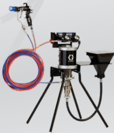
30:1 air-assist stand mount with hopper