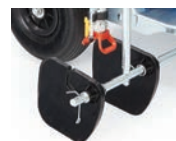
FieldLazer S90 Adjustable Spray Shield