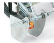
FieldLazer S100 Adjustable Spray Shield