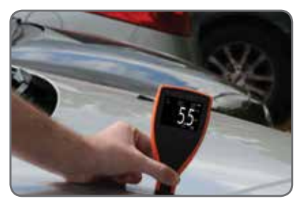
Measures on steel & aluminium body panels ^{\mathrm{2}}

Switches instantly to measure coatings on steel & aluminium<sup>2</sup>