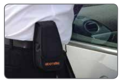
Durable & impact resistant case clips straight on to your belt