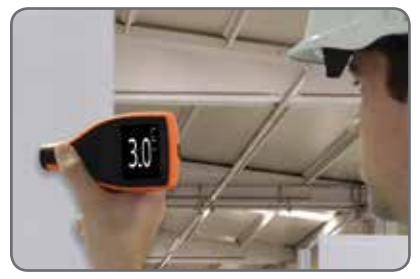
360° auto rotating display for a clear reading at any measurement angle, on the production line or QA station.

Automatically switches between ferrous & non-ferrous substrates<sup>1</sup>