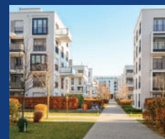
Maintenance and Remodeling