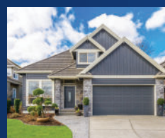
New Residential and Repaint

FOR EVERY PAINTING AND FINISHING APPLICATION