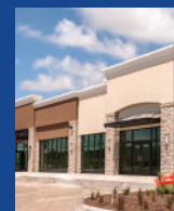
Commercial and Multifamily