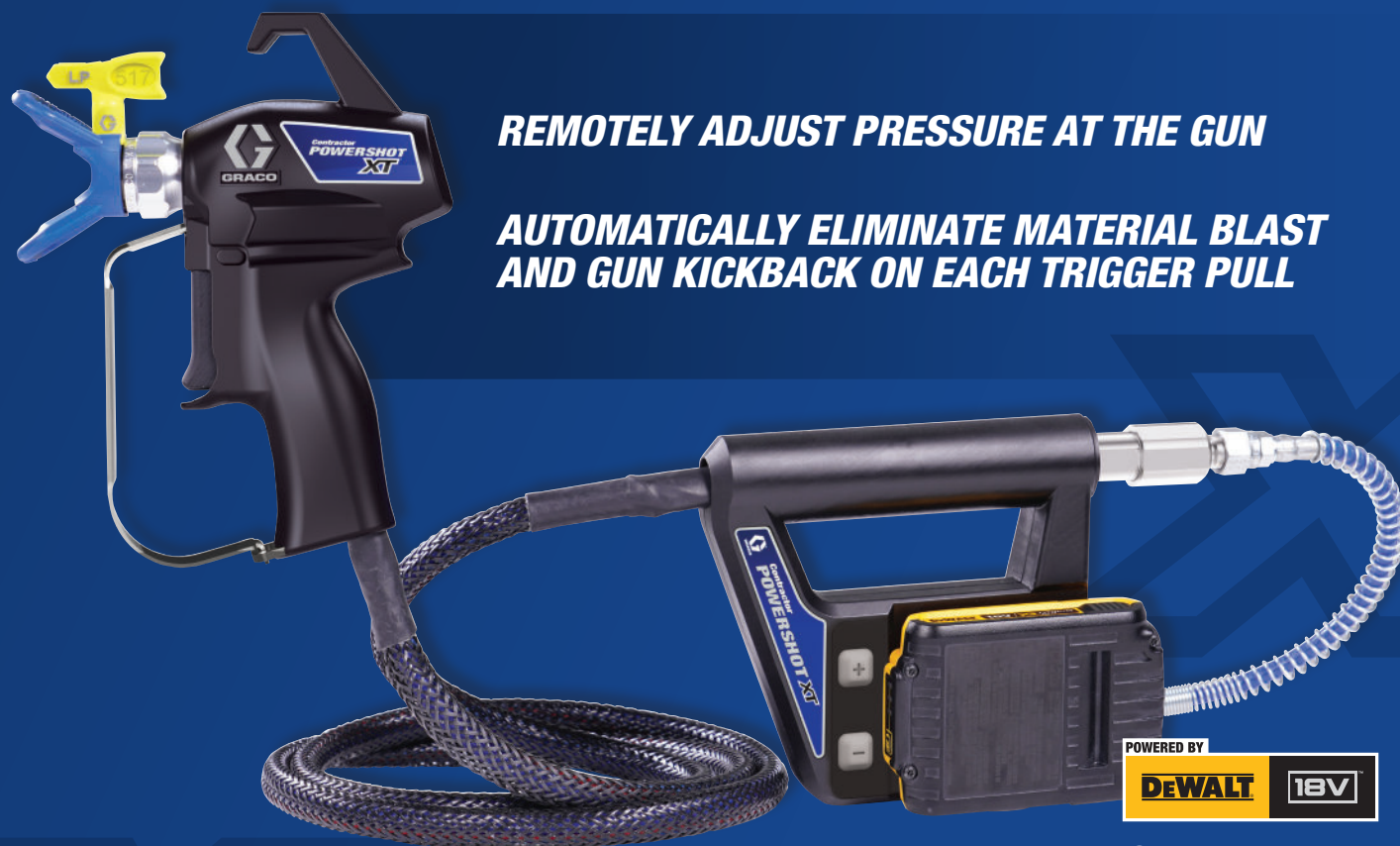
Contractor PowerShot XT

PLUS INSTANT GUN-TO-SPRAYER COMMUNICATION