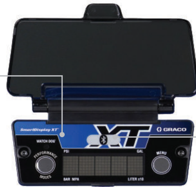
SmartDisplay XT Part Number: 20B432