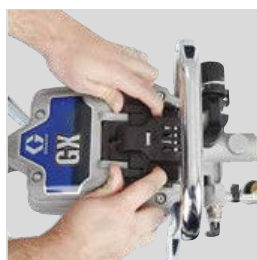
1. Slide and lift open access door

In four simple steps, you can remove and replace the pump cartridge: