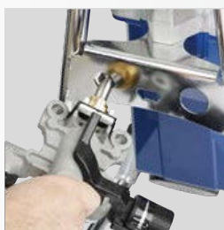
3. Use frame hex fitting to loosen pump and remove cartridge